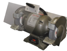
Direct-Mount or Magnetic-Mount Bench Grinder Shields with Flexible Arms

Double-wheel bench grinder shields provide protection for both wheels of the grinder with one continuous shield. The durable shield is made of clear, 3/16-inch-thick polycarbonate and measures 18-inch x 6-inch. A special shield bracket adds stability to the top of the shield. The single-wheel bench grinder shield is made of clear, 3/16-inch-thick polycarbonate and measures 6-inch x 6-inch. This sturdy, impact-resistant shield is designed for use when a single wheel needs safeguarding. These shields have a direct-mount base that attaches directly to the grinder table or pedestal.