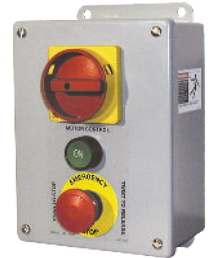
Single-Phase Disconnect Switch

This single-phase unit is designed for motors that have built-in overloads. Typical applications for these combinations include smaller crimping machines, grinders, drill presses, and all types of saws. The 115-V, 15-A disconnect switch and non-reversing magnetic motor starter are housed in a NEMA-12 enclosure. Enclosure size is 8" x 6" x 3-1/2". It includes a self-latching red emergency-stop palm button and a green motor control start push button. It can be used on machines with 115-V and is rated up to 1/2 HP maximum. The disconnect switch has a rotary operating handle which is lockable in the off position only. This meets OSHA and ANSI standards.