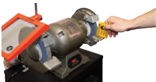
Grinder Gauge 1/8 Work Rest

“Grinder safety gauges” can be used during the installation, maintenance, and inspection of bench/pedestal grinders to make sure the work rests and tongue guards comply with OSHA’s 1910.215 regulation and ANSI standards. Wait until the wheel has completely stopped and the Grinder is properly “Locked Out” before using a “grinder safety gauge”. Grinder coast-down time takes several minutes, which tempts employees to use the “grinder safety gauge” while the wheel is still rotating. This practice is very dangerous because it can cause wheel breakage.