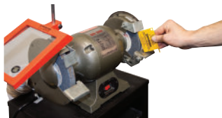
Grinder Gauge 1/4 Tongue Guard

Where grinders are concerned, personal protective equipment (PPE) usually means a full face-shield, not just safety glasses. You cannot be too careful with a machine that operates at several thousand RPM.