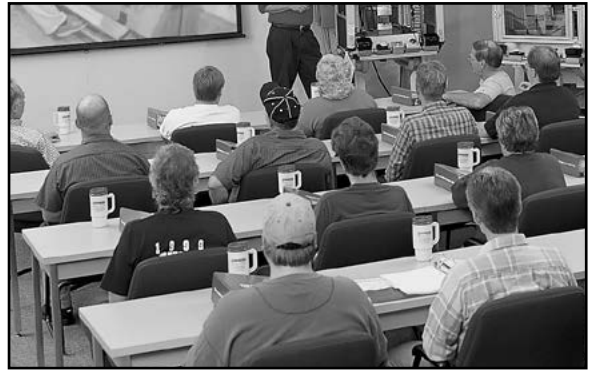
Training center at Rockford Systems, LLC

To register for one of our seminars, please call, fax, e-mail, or visit us online to request our seminar catalog or to obtain further details.